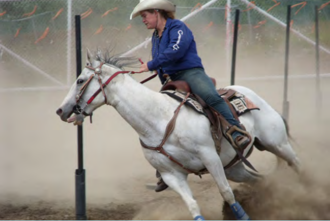
Gymkhana at the rodeo