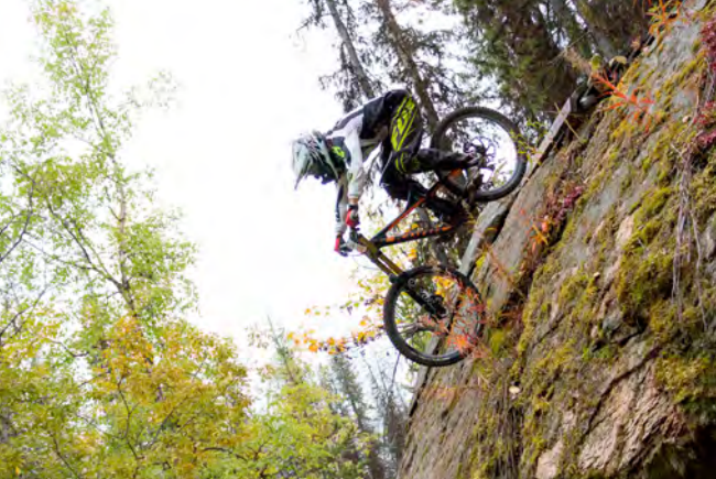
Hankin-Evelyn Mountain Bike Trails