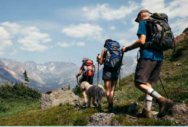
Babine Mountain Range