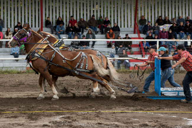
Lakes District Fall Fair