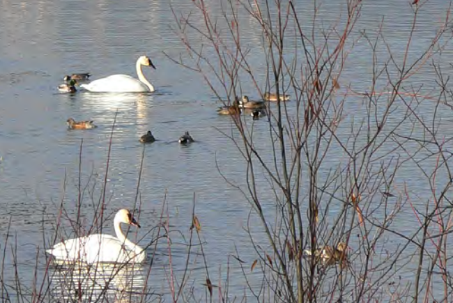
White Swan Park downtown Fraser Lake