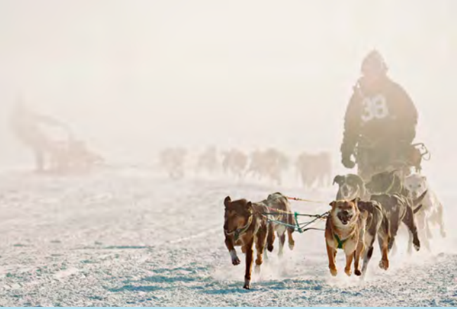
Caledonia Classic Dog Sled race on Stuart Lake