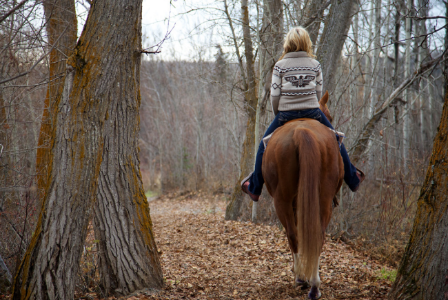
Interpretive trail along the Nechako River Migratory Bird Sanctuary